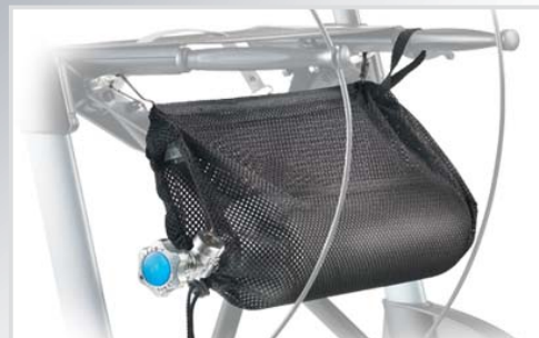
Basket for oxygen bottle (only compressed, not liquid) 814009