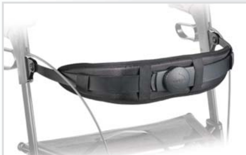
Adjustable back support with padding, for rollators from 2009 814726