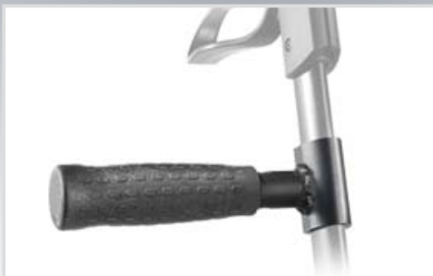
Guiding handle e.g. for the visually impaired 814014