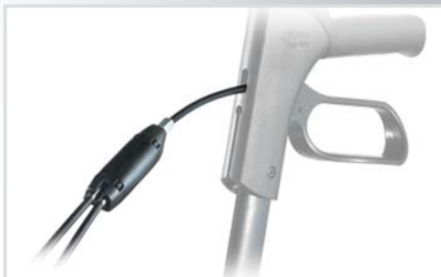
One-handed brake 814026