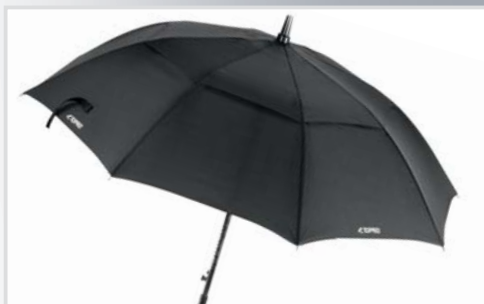
Umbrella with attachment 814068