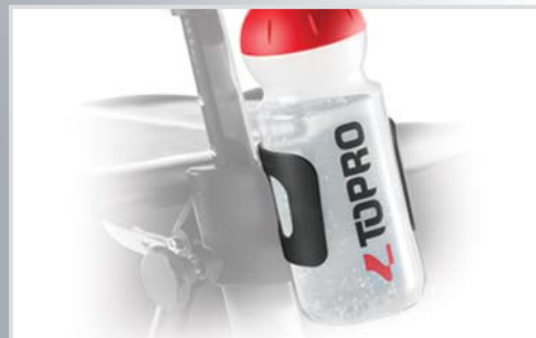
Bottle holder 814043