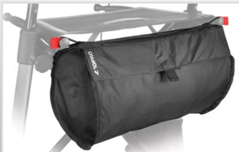
Rear bag with zipper 814046