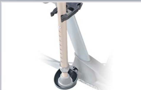
Crutch holder 814040