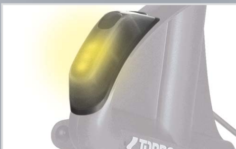
LED light with integrated fall alarm (pair) 814639