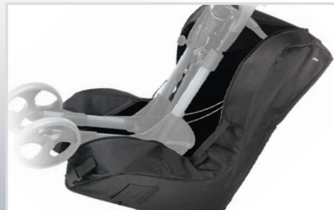
Transport bag 814042